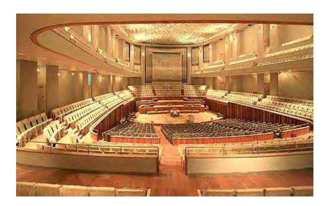
Figure 3 GRC used in the music hall of the National Grand Theatre

Figure 3 is a photograph of the music hall of the National Grand Theatre. Inside the hall, GRC ceilings and GRC wall boards were used. Ceilings were manufactured by Beijing Baogui StoneArt Co. Ltd. Total area of ceiling was about 1300 \, \text{m}^2 , individual ceiling board was 3420mm long, 2260mm wide and 24mm thick. The surface of ceiling was corrugated, the maximum convexo-concave was 480 mm. Wall boards were manufactured by GRC Building Materials Industry Co. Ltd. Total area was arround 2000 \, \text{m}^2 with a standard board size 3.3 \times 1.1 \, \text{m} . The whole wall surface was shaped into sea waves.