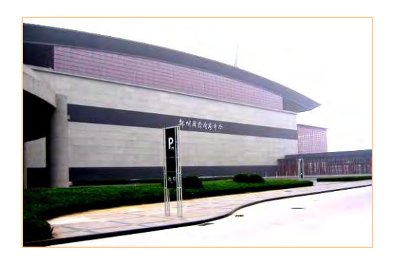
Figure 8 Zhengzhou International Convention and Exhibition Centre

Figure 8 is a photograph of Zhengzhou International Convention and Exhibition Centre. GRC were used in the eastward and westward wall, the secondary entrance and cornices. Total GRC area was about 10,000\text{m}^2 . The dimension of the largest panel was 4\times2 m.