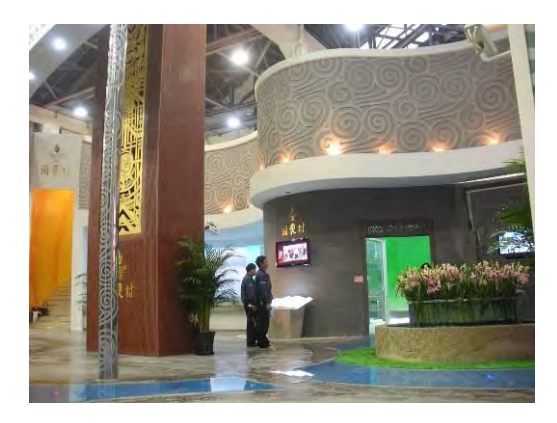
Figure 6 GRC external wall in Beijing Guo'ao Gallery

Figure 6 is a photograph of Beijing Guo'ao Gallery, which was presented at Shanghai World Expo. External wall were made of GRC.