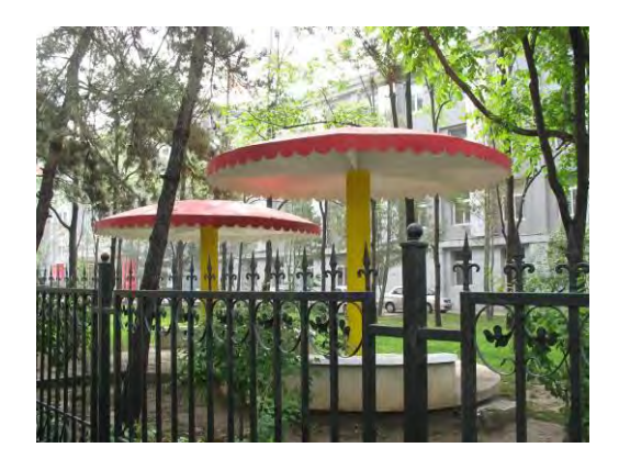
Figure 19 Pavilion made of GRC in 1984

Figure 19 shows two pavilions made of GRC in 1984, after 27 years, They still stand soundly around the hurst in the compound of China Building Materials Academy.