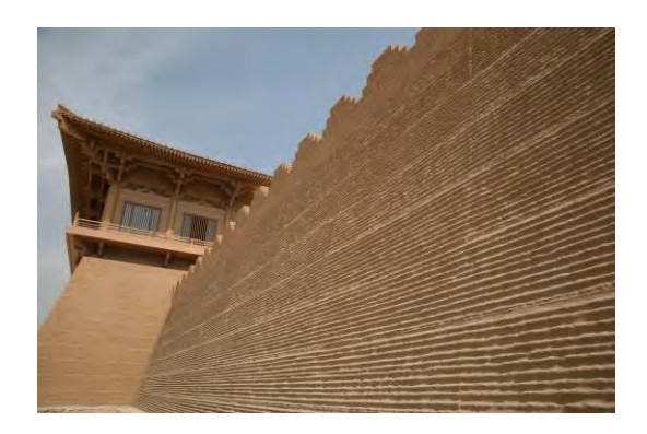
Figure 5 Hybrid panels of GRC and concrete in Xi'an Daming Palace

Figure 5 shows the GRC and concrete hybrid wall panels used in Xi'an Daming Palace.