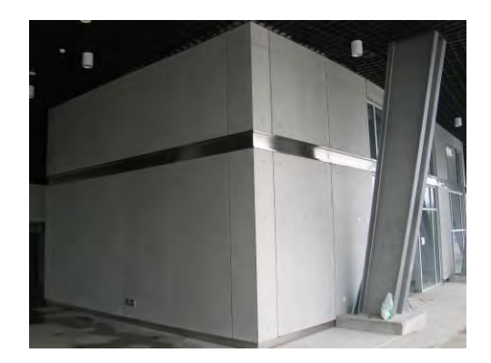
Figure 10 GRC panel used in elevator rooms in the National Olympic Athletics Centre

Figure 10 shows GRC panels used as exterior wall of an elevator room, which is part of the reconstructing and extending project for National Olympic Athletics Centre. There were six elevators in this project. Due to the elliptical shape of the Athletics Centre, the outward side of these elevator rooms had to follow the elliptical curve. Most GRC panels were made into irregular shape, for example, L-shape panels to enclose doors and windows and U-shape panels to cover columns. Most corners were not right-angled. Ribbed GRC panels were designed at maximum dimension of 2×3.2m. Typical panel thickness and rib depth was 15 mm and 140mm respectively.