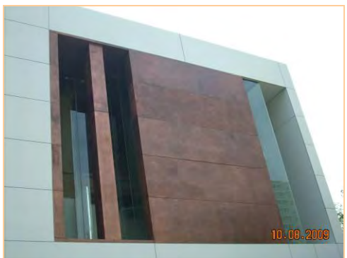
Figure 13 Artificial copper columns and wall panels

Another project using artificial copper panels was the Army Exhibiting Hall in Zhengzhou Virescence Exposition shown in Figure 14. Due to the irregular 3-D profiling of the structure, panel dimension and fixing types were diversified. Individual panel was ribbed U-type. The total area is about 3000m<sup>2</sup>.