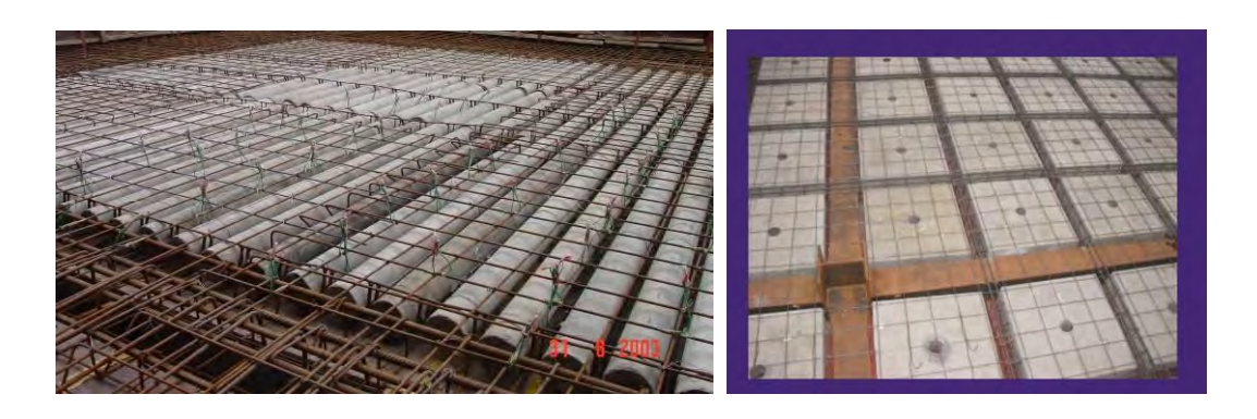
Figure 15 Application of GRC thin-walled hollow core formwork

expand its application scope. GRC hollow core formwork can be categorised into box-type, column-type and trapezium-type. Figure 15 shows an example of the application of GRC thin-walled hollow core formworks..