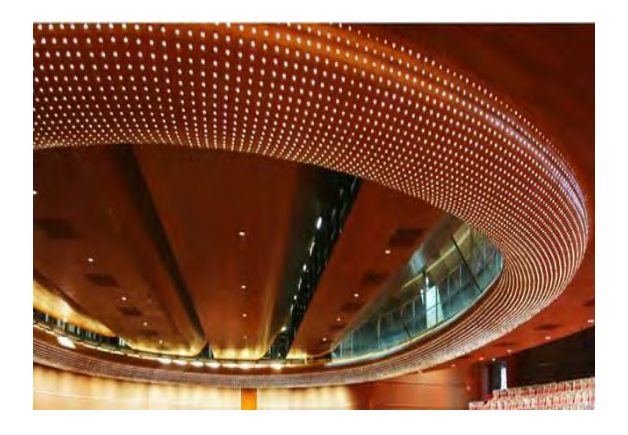
Figure 4 GRC in the opera house of the National Grand Theatre

Figure 5 shows the GRC and concrete hybrid wall panels used in Xi'an Daming Palace.