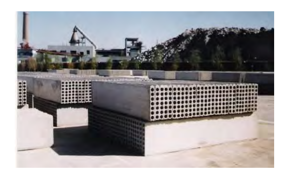
Figure 17 GRC hollow wall panel for partition wall

600mm. The length ranges from 2500mm to 3000mm at a thickness of 90mm. At a thickness of 120mm, the length can be increased up to 3500mm. This product is guided by national standard GB/T 19631 - Glassfibre reinforced cement lightweight hollow panel for partition, which was upgraded from building materials standard JC/T 666 - Glassfibre reinforced cement lightweight hollow panel for partition, established in 1999 and revised in 2005. GRC partition wall panel was developed following the government's Wall Reform policy, which was targeting lighter weight and better insulation wall materials. This product is normally made by either group-shutter cast process or spray process. Figure 17 is a picture of a hollow wall type GRC partition wall panel.