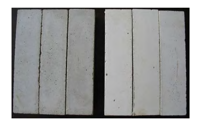
Figure 2 Comparison of sample colours

reasons, this cement is widely used in China GRC industry. Quality criterion of CSA cements is GB 20472 - sulphoaluminate cement. In recent years, demand on coloured GRC products is increasing, this normally needs to add inorganic pigments into very light colour cement. Wanglou Cement Industry Co., Ltd. has successfully developed a white CSA cement to meet this demand in 2010. Systematic experiments are undergoing to enable mass production. Figure 2 shows the colour difference of samples made from traditional and white CSA cements.