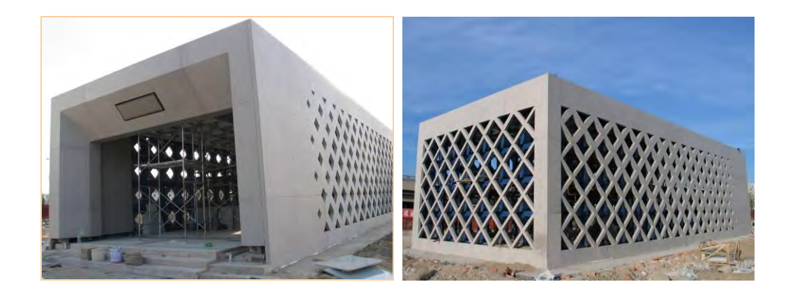
Figure 12 Entrance of subway station

Figure 12 shows the entrance of a subway station of Line 15 in Beijing. Totally 3000m<sup>2</sup> precast GRC grid panel were used. Standard panel size was 2×2m with thickness of 100mm.