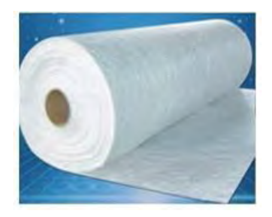
Figure 1 AR glassfibre mat

Quality of AR glassfibre products shall comply with JC/T 572 - AR glassfibre roving and JC/T 841 - AR glassfibre mesh. While continuing improving the quality and performance of AR glassfibre roving and AR glassfibre mesh, Xiangfan Huierjie Glassfibre Co. Ltd. has successfully developed AR glassfibre mat (Figure 1) in 2008. This product is manufactured by cutting glassfibre strand (filament diameter: 9-11\mu m ) into 50mm length then bonded by adhesives and flattened. The specially developed adhesives dissolve rapidly in cement slurry when meet with water, enabling chopped strands disperse and combine with cement slurry closely, and hence the performance of GRC products is improved. So far, AR glassfibre mats have been applied in many projects and showed good effect.