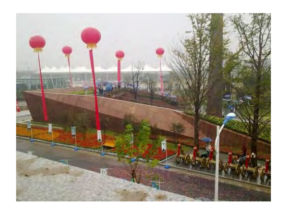
Figure 14 Army Exhibiting Hall in Zhengzhou Virescence Exposition

Another project using artificial copper panels was the Army Exhibiting Hall in Zhengzhou Virescence Exposition shown in Figure 14. Due to the irregular 3-D profiling of the structure, panel dimension and fixing types were diversified. Individual panel was ribbed U-type. The total area is about 3000m<sup>2</sup>.