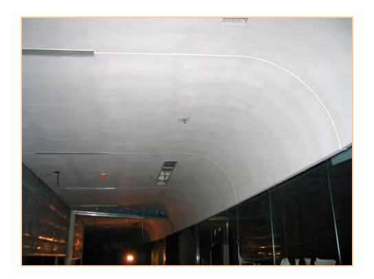
Figure 11 Double curved ceiling used in a shopping centre in Beijing

width range. The ceiling panel was ribbed and stud frame hybrid construction. Maximum size was 3000mm×2000mm. Thickness of panel was 15mm and depth of rib was 150mm.